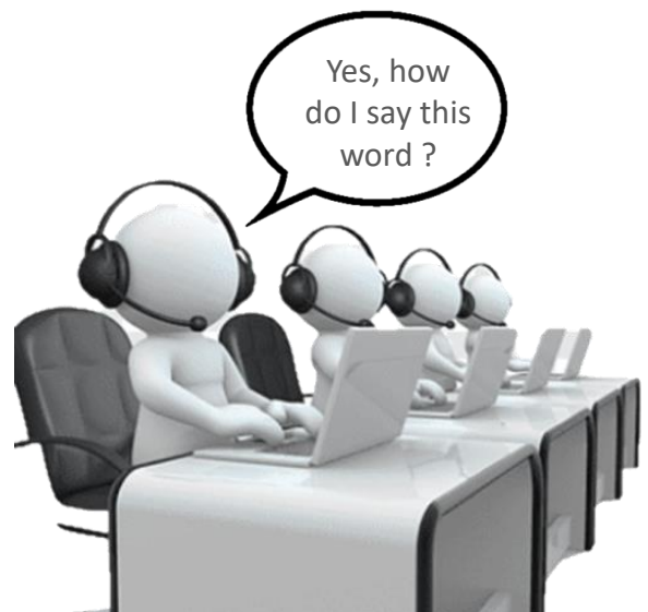
Discrete Intercom With Selected student