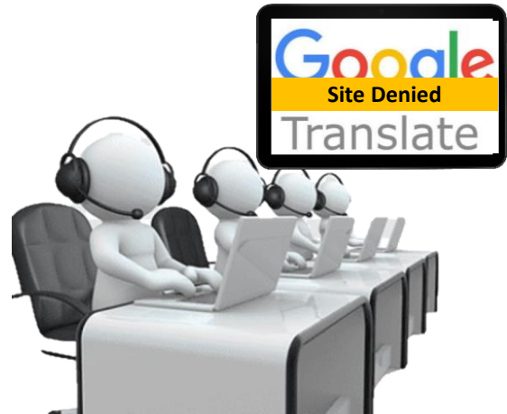
Site Access Denied for Students