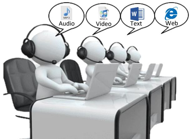
Students Work on Received Playlist Files