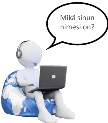
The Teacher Speaks

The teacher can use the live audio feature to ask the whole class questions simultaneously , there is no need to work with individual students unless preferred. The students, as a class, simply respond with their answers and the advanced software will collect back each individual student recording, with their name, and save it as an MP3 file to a drive of your choice for later assessment.