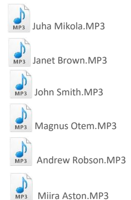
The Teacher Auto Collects Work