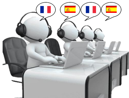
Students Practice Live Role Play