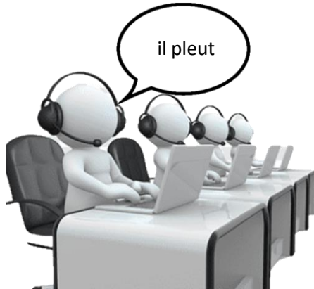
The Students Speak