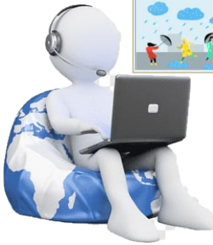
The Teacher Launches an Image