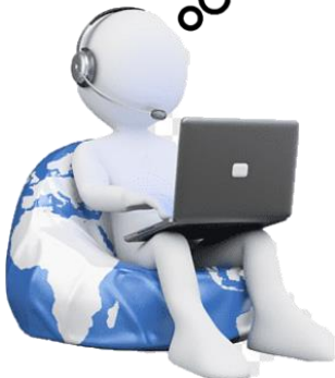
Teacher Sets Pair Work