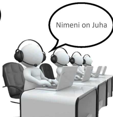
The Whole Class Responds